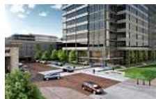
Trammell Crow Co. starts work on Legacy Towers