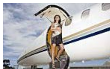
5 Richest Women In The U.S.