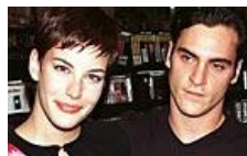
14 Famous Couples Time Forgot (But We Never Will)