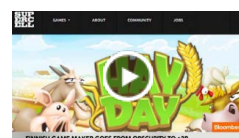
Finnish Game Maker Goes From Obscurity to $3B