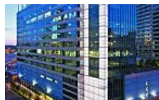
Regions Bank moves HQ to Uptown Dallas