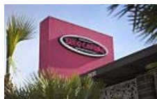
Fiesta Restaurant Group relocates headquarters to Addison