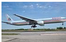
American Airlines facing tough times, columnist says