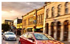
25 Fuel Efficient Cars That Are Not Hybrids