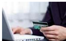
4 Places You Should Avoid Using Your Credit Card