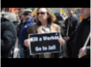
A Closer Look VIDEO: Day of Mourning 2014