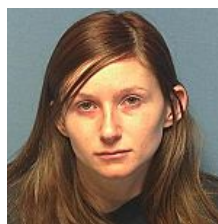
3-Year-Old Dies After His Mother Leaves Him Home Alone for 20