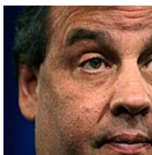
Have you heard about the Chris Christie bombshell no one is (Blue Nation Review)