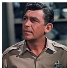
Andy Griffith's Widow to Raze His Home