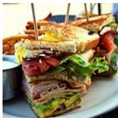
Dallas' 9 Best Sandwiches (Zagat)