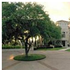
Matthew McConaughey's Austin Estate vs. Airstream