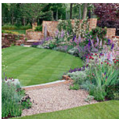
20 Backyard Landscaping Ideas 20 photos