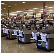
The 13 Worst Supermarkets in America in 2014 (The Fiscal Times)