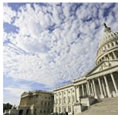
10 States Most Dependent on the Federal Government (Wall St. Cheat Sheet)