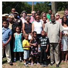
Michelle Obama's mixed race heritage proved by DNA (Ancestry.com)