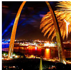
25 Additions for Any Bucket List (Explore St. Louis)