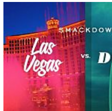
Smackdown: Las Vegas vs. Dubai (Yahoo!)