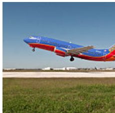
Everything Changes for Southwest Airlines Today (Money)