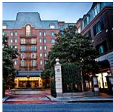
Little Known Hotel Secrets (StyleBlueprint)