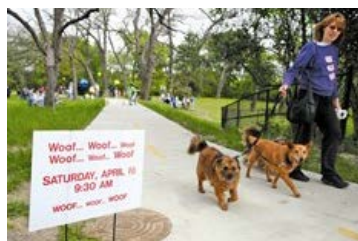
Dallas Trails Get Top Priority in NCTCOG Funding Recommendations, May Pull in $5 Million