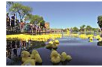
Brighton's annual July Fourth parade and