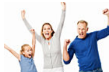
Top Voted Credit Cards with 0% APR until 2016 Next Advisor Daily