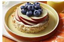
10 Healthy and Quick Snack Ideas Minq