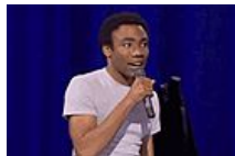
Discover How To Live A Happier Life! #10 Is A... GoWeLovelt