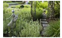
2014 LACASA Garden Tour