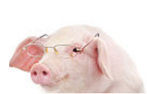
10 Animals Who Are Almost as Smart as... Brainjet