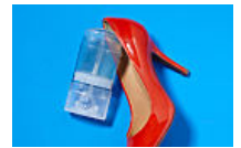
10 Fashion Hacks to Solve Your Wardrob... Answers