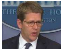
ABC's Jonathan Karl Just Mopped The... Downtrend