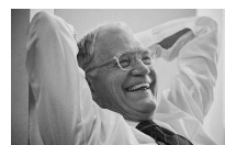
King David Letterman going out on top of longevity list for late-night TV hosts