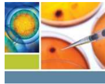
You might be surprised by what's... TheHill.com