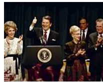
The 12 Last Presidents Ranked from Worst... InsideGov