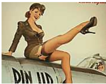
These 179 Rarely Seen Historical Photos... Daily Sanctuary