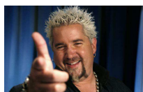
That Guy Exclusive: Burger joint from Guy Fieri now open in Dallas, with limited hours